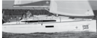
Sun Odyssey 349