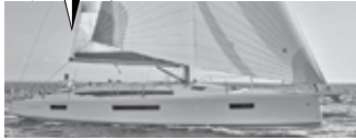
Sun Odyssey 410