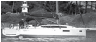
Sun Odyssey 380

Jeanneau's fast and fun power & sailboats offer the perfect way to enjoy the water. Supplies are currently very limited, so order now to secure 2022 delivery.