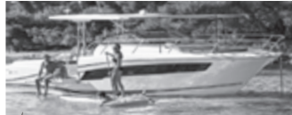
Leader 10.5 - Series 2

This fast and fun power boats offer the perfect way to enjoy the water this summer. Power or sail, come see the Jeanneau difference for yourself.