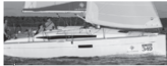
Sun Odyssey 349

Jeanneau's fast and fun power & sailboats offer the perfect way to enjoy the water. Supplies are currently very limited, so order now to secure 2022 delivery.