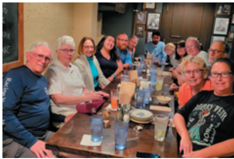
AFSC Port Washington Cruise