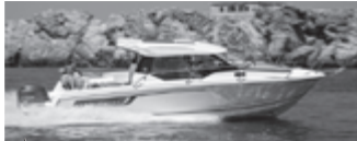
NC 795 Series 2

Jeanneau's fast and fun power & sailboats offer the perfect way to enjoy the water. Supplies are currently very limited, so order now to secure 2022 delivery.