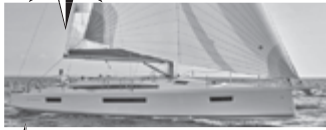
Sun Odyssey 410