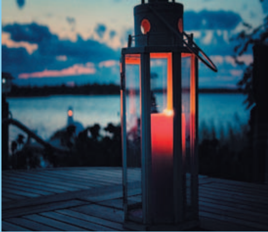
AWARDS BANQUET JANUARY 27, 2024