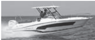
Leader 7.5 WA

Jeanneau's fast and fun power & sailboats offer the perfect way to enjoy the water. Supplies are currently very limited, so order now to secure 2022 delivery.