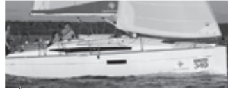
Sun Odyssey 349